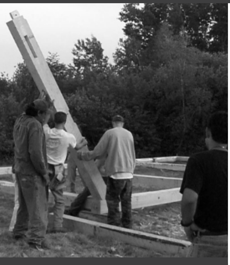
The beams of Rice Hall were fashioned as part of a community timber framing class led by Tim Beal in the early 2000s and the frame was raised in April 2004.

To resolve this, we are making some shortterm improvements to our campus to enhance wheelchair accessibility for Rice Hall, the Commons, and the Heartwood Lodge, but more substantial improvements are needed to ensure easy year-round access to all buildings and improved access to outdoor spaces such as the bandstand.