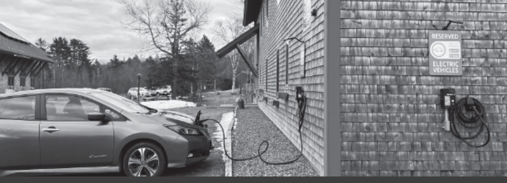
Our two new EV (electric vehicle) chargers are on the Northwest corner of Heartwood Lodge.